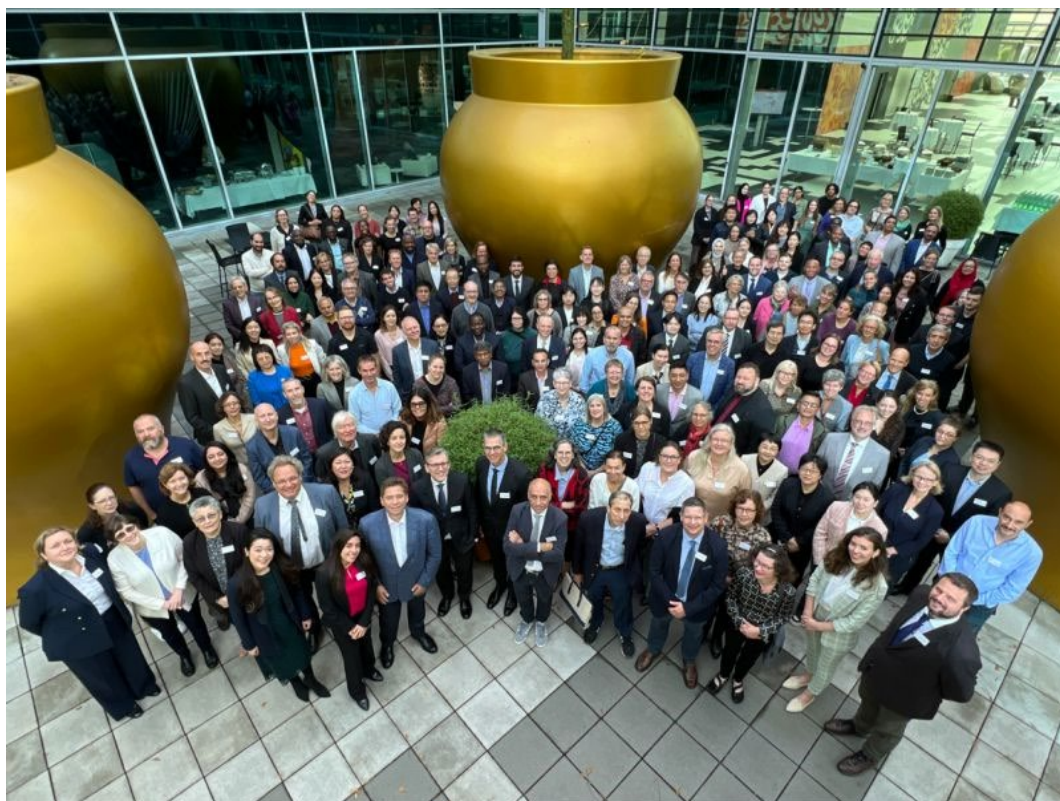
Attendees at the 2023 WHO-FIC Annual Meeting in Bonn, Germany