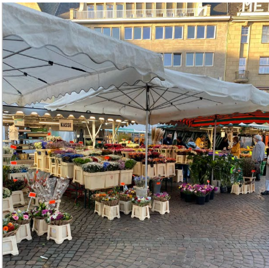
2023 WHO-FIC Annual Meetings in Bonn, Germany - Bonn flower market